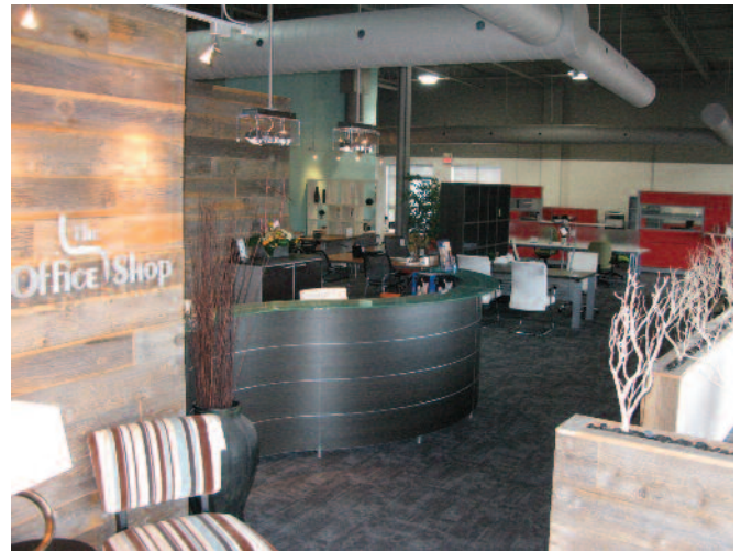
The Office Shop places contract furniture in a warmly elegant setting.

In September, Markham, Ontario, furniture dealership The Office Shop celebrated the renovation of its 5,000-square foot showroom with a party. Designed